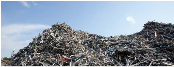
Aluminium scrap treatment plant