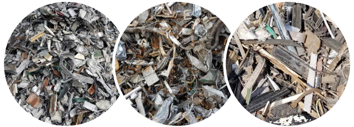
Tins and cans from MSW treatment plant